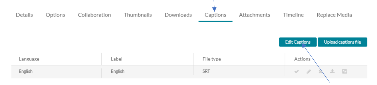
Step 6: The caption editor will open.

Edit the desired caption in the text field on the left of the page.