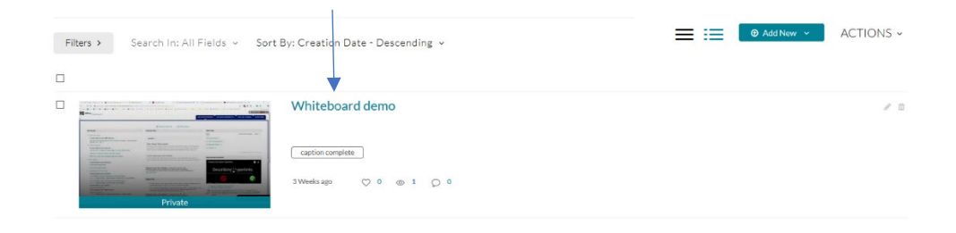
Step 3: Click the Actions drop-down menu and select "Edit."